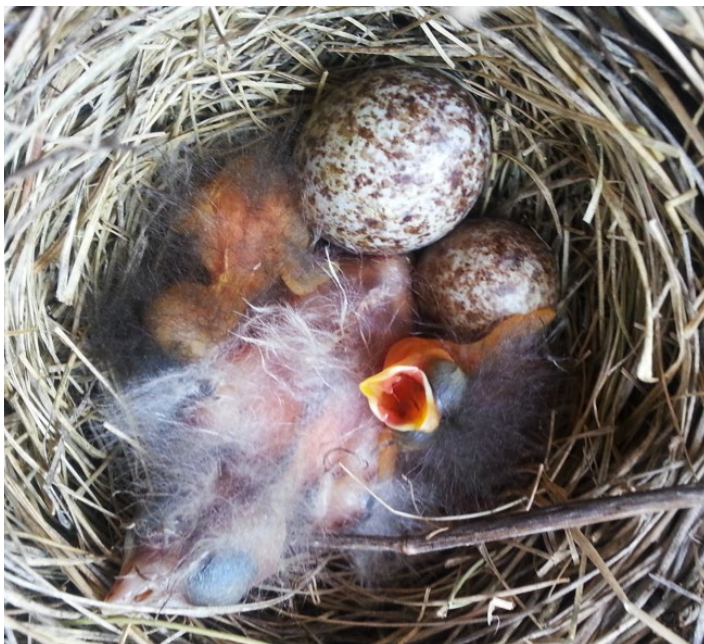
Figure 1. Cowbird chicks.

Brown-headed cowbirds ( Molothrus ater ), are North America’s most common “brood parasite.” These birds parasitize the nests of female birds of another species, laying their eggs in their nests, and leaving the host parents to raise the cowbird chicks (Figure 1). The data in Table 1 are from a study on the effect of brown-headed cowbirds in relation to the position of the nests in the forest. Specifically, the study investigated whether proximity of nests to the forest edge was related to the incidence (or likelihood) of cowbird parasitism. This is an important issue for the conservation of forest birds, because forests are increasingly fragmented by roads—a process that can create new forest edges—and cowbird parasitism can have a strong negative effect on nest success in some cases.