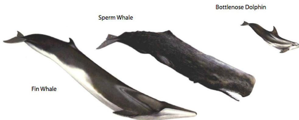
Figure 2. Selected cetacean species of the Ligurian Sea

Notarbartolo di Sciara, 1994; Beaubrun, 1995). Because these species are also susceptible to entanglement in fishing gear and ship strikes (Figure 4), they will also benefit from the protection afforded by the Pelagos Sanctuary. Additionally, the highly endangered Mediterranean monk seal Monachus monachus , which was extirpated from this area in the mid 20th century, could theoretically re-colonize the Sanctuary waters if its popula-