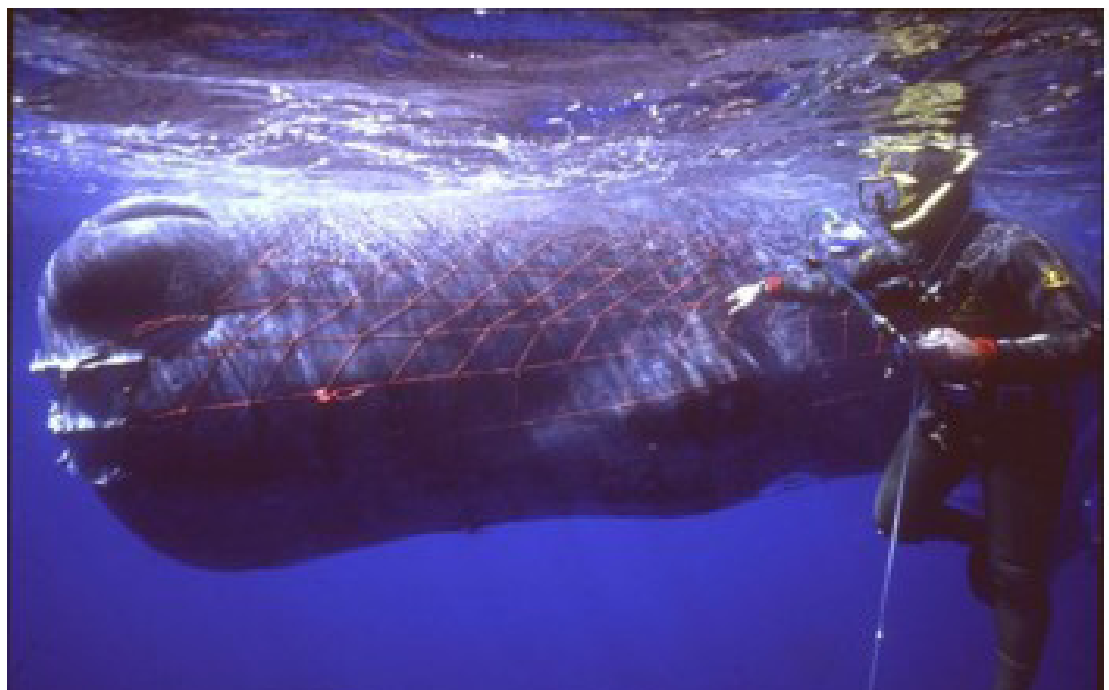
Figure 4. Cetacean entangled in fisheries equipment

Therefore, an understanding of the dynamics and the scales of the processes responsible for the formation of these important physical (e.g., hydrographic front) and biological (e.g., euphausiid concentrations) aspects will be critical to assess the degree to which the Pelagos Sanctuary will encompass the fin whale foraging grounds in the future. Furthermore, an improved understanding of the ecological significance of the Pelagos Sanctuary for marine mammals over the long-term requires an assessment of their local trophic requirements and of the abundance and dynamics of their fish and squid prey (Hooker and Gerber, 2004). In particular, the extent that the location and extent of these features vary in time and space will influence the criteria and the success of any zonation process. The Parties to the Pelagos Sanctuary Agreement are still insisting that no zoning measures be introduced in the management plan. Zoning is the spatial definition of activi-