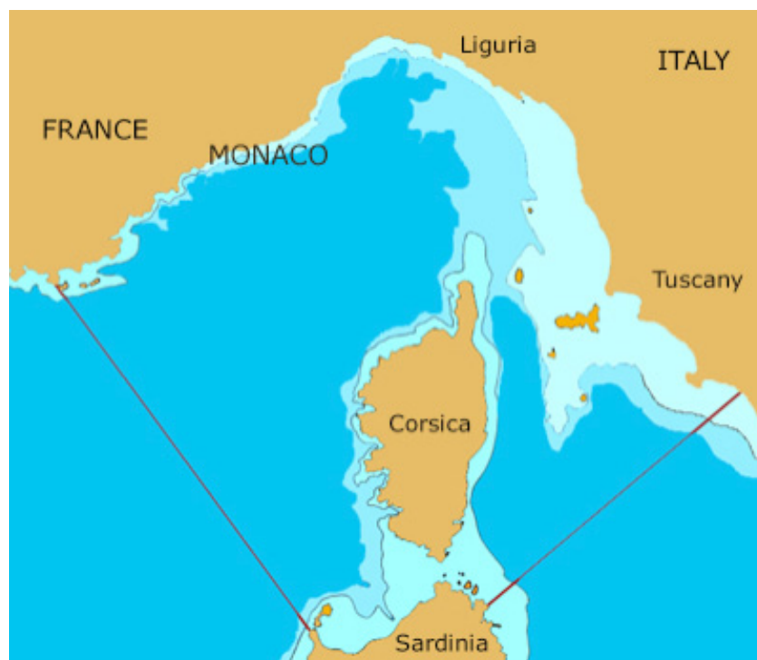
Figure 1. The Pelagos Marine Sanctuary

lished a global moratorium on large-scale pelagic drift net fishing (Scovazzi, 1998). In addition to fishing, other major anthropogenic impacts on the marine environment began affecting cetaceans. Maritime traffic, including high-speed passenger vessels, pleasure craft, naval ships and expanding commercial whale watching activity were all increasing, with the risk of disturbance and collisions (Notarbartolo di Sciara et al., 2007). Growing ship traffic also carried with it the risk of hazardous substance release, such as occurred during the 1994 oil spill caused by the blaze of the tanker Haven off Genoa. These threats slowly entered the public consciousness.