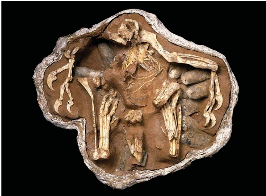
This is one of the Citipati fossils. The feathered wings are spread over the nest to protect the eggs, the same way birds do today.

Seventy years later, in 1993, another team from the Museum found very similar fossil eggs in the same desert. One of the eggs held an embryo, or developing baby dinosaur. It turned out to be a baby Citipati (sit-uh-PAH-tee), a kind of dinosaur very similar to Oviraptor . Later, the team discovered an adult Citipati over a nest. It was brooding, or sitting on the nest, the same way birds do: with its arms spread to protect the eggs. And if its arms were covered with feathers, as scientists suspected, these wings would have shielded the eggs from heat and cold. Paleontologists realized that these dinosaurs nested like birds living today.