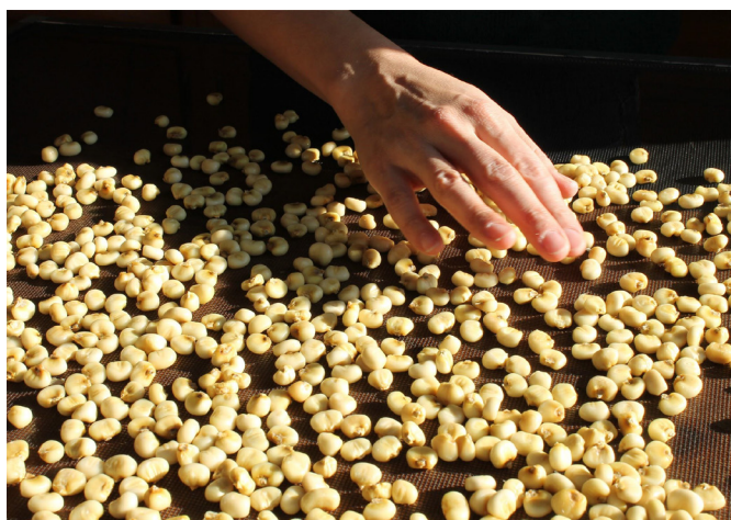
From Onëögë:n to Gá:hgok Steps for Making Boiled Cornbread