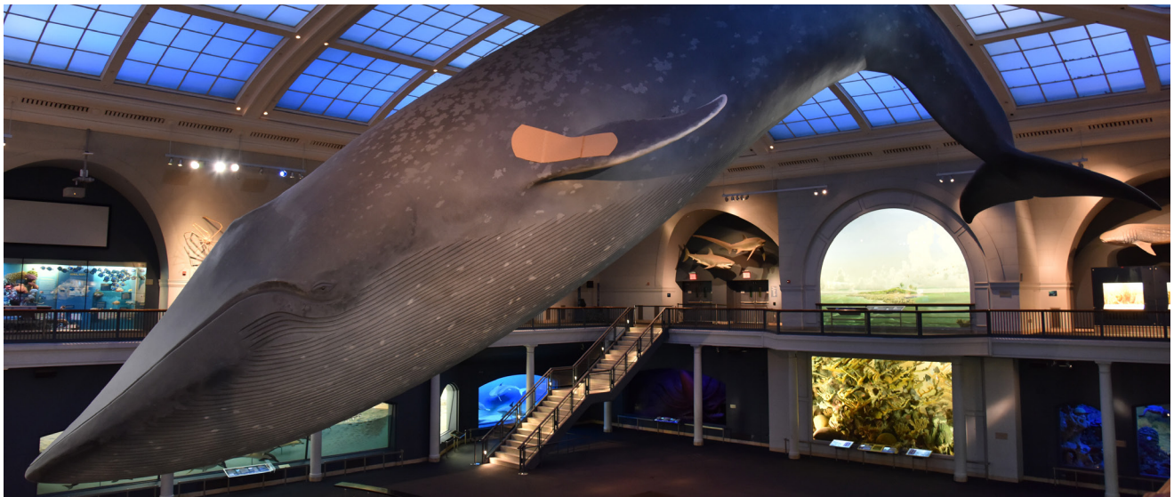
In April 2021, the Museum opened a COVID-19 vaccination site in partnership with the City of New York—under the iconic blue whale in the Milstein Hall of Ocean Life, now sporting a bandage on its fin.

Meanwhile, Museum scientists nimbly adjusted to the ongoing suspension of international fieldwork, continuing to publish, collaborate, mentor, and educate. Existing special exhibitions were extended to welcome as many visitors as possible, and were met with exceptionally high rates of visitation. Several education programs for the Museum's youngest learners returned onsite, while other programs for older children and youth that had transitioned online at the start of the pandemic continued virtually—an approach that has proven uniquely accessible. And several major capital projects, beacons of science and the future, progressed—including the heralded renovation and reopening of the Allison and Roberto Mignone Halls of Gems and Minerals, one of the Museum's most beloved permanent halls.