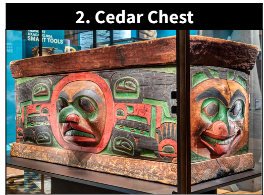
2. Cedar Chest