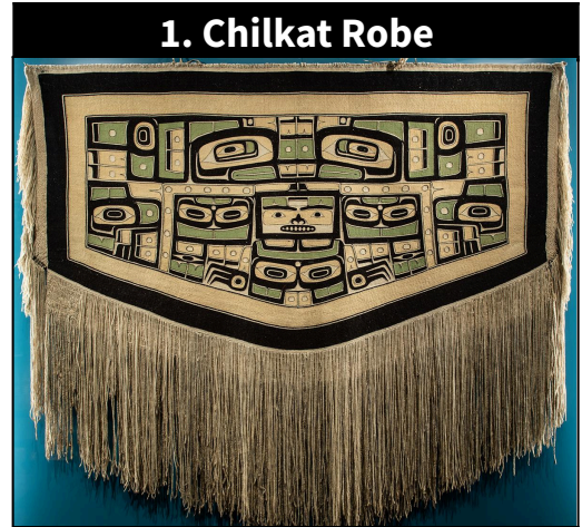
1. Chilkat Robe