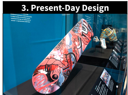
3. Present-Day Design