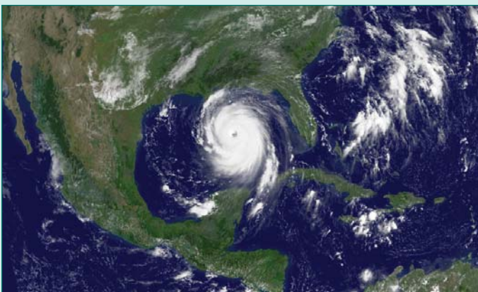
Tropical cyclones like Katrina, above, are fueled by heat released when moist air rises and the water vapor it contains condenses.