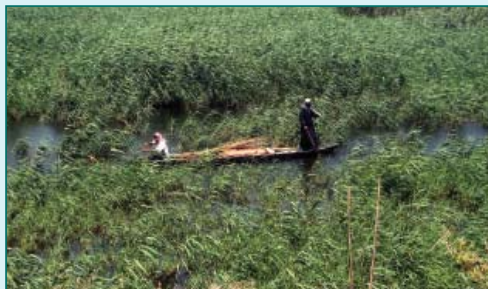
The marshlands of Mesopotamia, which cleaned the waters of the Tigris and the Euphrates, were drained during the 1991 Gulf War. They have responded well to reflooding by the native Ma’dan people.