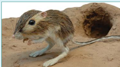
Some species never drink! Kangaroo rats get all the water they need from the food they eat.