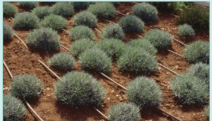
Drip irrigation systems like this one use tubes or pipes on or under the soil to deliver water. This low-pressure method is efficient and loses less water to evaporation than other forms of crop irrigation.

Earth's water is a finite resource. The availability of water on land varies due to weather patterns, evaporation rates, and other factors. Most water is contained in the oceans. Less than 3% of all water on Earth is fresh, and less than one-third of that is liquid.