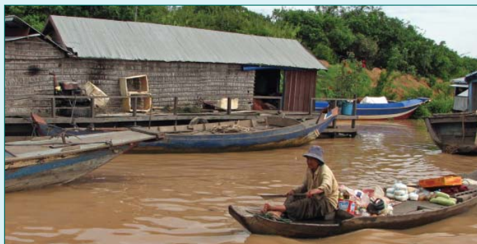
During Cambodia's monsoon season, the Mekong River runs backwards and Tonle Sap Lake expands. Houses on floats move with the lake's edge.