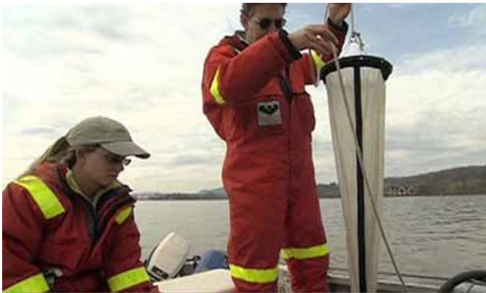
Small and large zooplankton are sampled by filtering river water through nets of different mesh sizes.

Sampling is expensive, and one challenge was deciding how many locations along the river would be sufficient. The Hudson River can be up to a mile wide and up to 90 feet deep, and its currents vary widely. Was the water homogeneously mixed, or were there significant differences between different depths and locations? How deep should they sample? Where the river is wide, would it be sufficient to sample a single point?