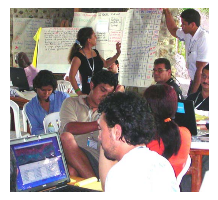
Fishers and conservationists using simulation software at workshop in Ecuador

1. Explore various factors that influence fish population viability and fishery sustainability; and