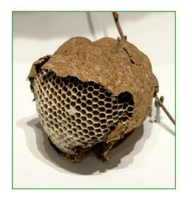
honey wasp nest

Insects can function as architects, creators, and decomposers. They build shelters that have inspired human architecture; they produce materials useful to humans, such as wax and honey; and they decompose waste materials such as rotting plants, animal carcasses, and poop, returning nutrients to the ecosystem.