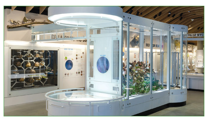
Observe ant behavior in the largest live leafcutter ant colony on display in the United States.

Insects have developed many adaptations for challenging others-to defend against enemies, battle rivals, and catch prey. And many social insects, such as the leafcutter ants in this large colony, work together like a superorganism.