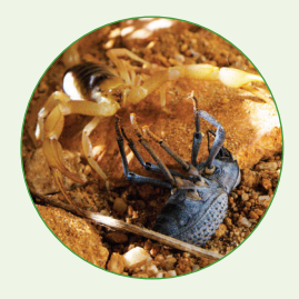
Watch videos of insect behavior