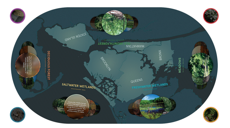
Students can match insects with their roles in various ecosystems and see where species have been observed throughout New York City.

6. Insects and Human Health interactive media | ii 5-6 | Three stations and a large video let visitors investigate some of the few insect species that spread diseases, where in the world they live, and how they affect human health.