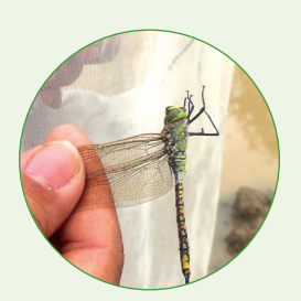
Watch videos of scientists at work