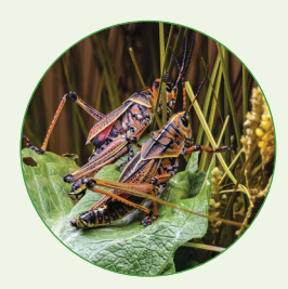
Observe live insects in various habitats