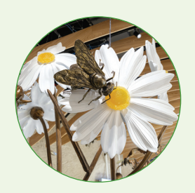
Interact with models and dioramas