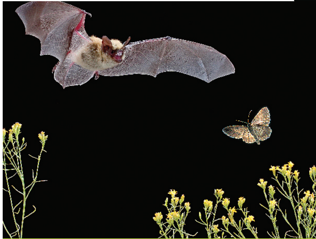
ON THE FLY: Many insect-eating bats snatch up their prey, such as moths, while flying.