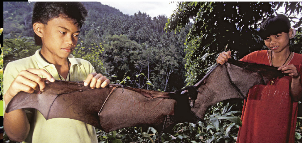
WIDE WINGS: The world's largest flying fox can be found in the Philippines.

Bats are distinct from other mammals. They are the only mammals that can fly. Bats also have long life spans for species of their size. A small bat may live to about 30 years, while a similar-size mouse would live one year. And unlike many other small mammals, which give birth to large litters, bats usually have only one or two offspring at a time.