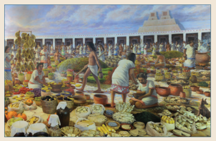
Vast and well organized, the market of Tlatelolco served up to 60,000 people a day. Beyond its walls loomed the Aztec city's great pyramid.

• Aztec marketplace diorama: Walk through the giant marketplace near Tenochtitlán in 1519 with your students. Food and other items were carried to this capital city from all over the thriving Aztec Empire (now Mexico). Invite students to examine what's for sale and to identify foods that look familiar. (e.g. peppers, tomatoes, corn) What common foods are missing? (e.g. bread, cheese, chicken) Have them find chocolate in different forms and explore how the Aztecs used it. (e.g. beverage, currency, tribute to conquerors, offerings to gods)