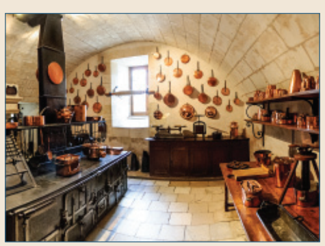
French chefs are famous for using copper pots, like those in this kitchen. Copper, an excellent conductor of heat, has been used in cooking for thousands of years in many parts of the world.

People in almost every culture around the world cook. Have students explore similarities and differences in the ways cultures around the world preserve and prepare food. (e.g. high-heat cooking in China, grinding corn in Mesoamerica,