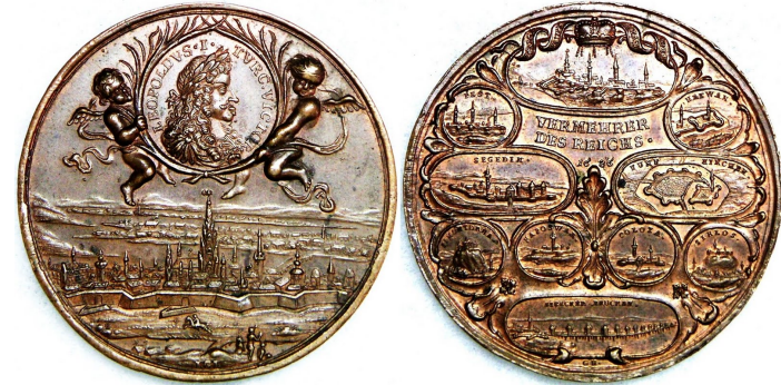
This coin of Leopold I (1640-1705), another Habsburg, again shows the characteristic Habsburg Lip. However, some coin collectors do not believe that this coin is accurate.