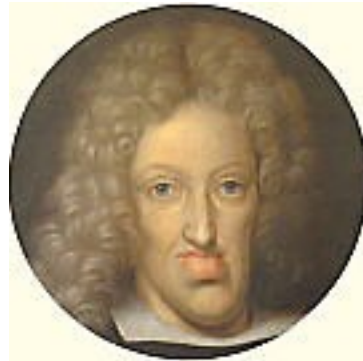
Charles II (1661-1700), the last Habsburg King of Spain had the most extreme case of Habsburg Jaw recorded. He was also mentally disabled. An analysis of the previous marriages that led to his birth reveals multiple uncle-niece marriages and first cousin marriages.