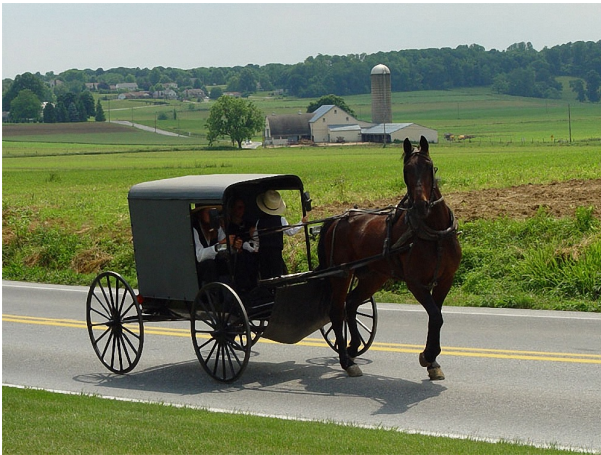
The largest Amish communities are in Ohio, Pennsylvania, and Indiana.