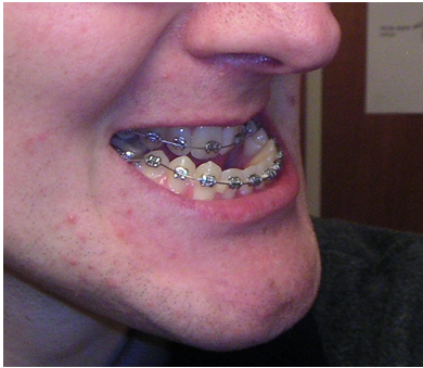
Photo of a person with Habsburg Jaw