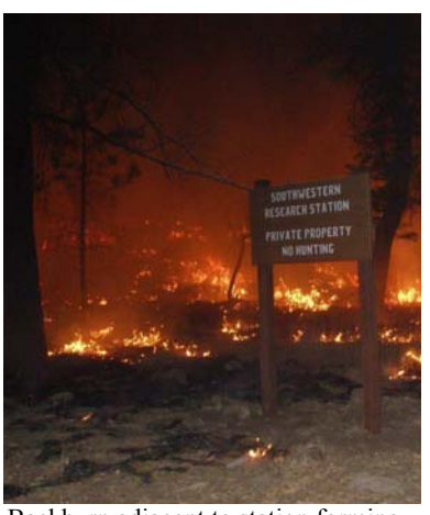
Backburn adjacent to station forming a firebreak by reducing fuel load