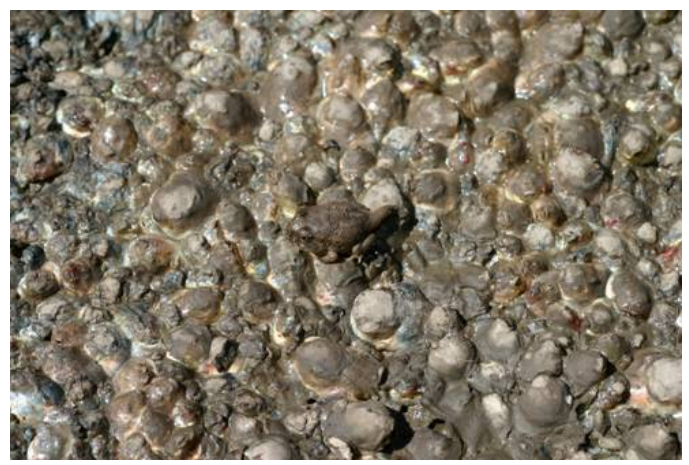
A recently metamorphosed spadefoot toad, sitting atop thousands of other tadpoles who are less fortunate. The more slowly developing tadpoles are dying of desiccation.

understanding larger patterns of diversity. First, we find that tadpoles in many of the ponds around SWRS consist of individuals of mixed species ancestry, suggesting that the behavior is generating exchange of genes between the two species. Second, geographic analyses combined with comparisons of museum specimens suggest that this behavior may have actually enabled the Plains spadefoot to expand its range into Arizona. Thus, female mating behaviors can explain why some species are found where they are. Members of my lab and I are currently seeking to evaluate the genetic basis of the behavior as well as its hormonal and neural correlates. Ultimately, our goal is to understand how patterns of natural selection in nature explain the evolution of traits at the genetic, neural and organismal levels.