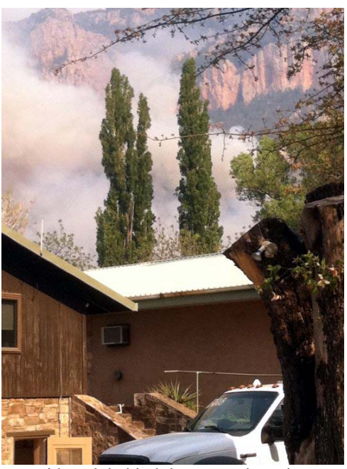
Reid Peak behind the research station

making it difficult or impossible for scientists to get to their study sites. A few scientists whose study seasons ran from May to June, tried to outwait the fire – some