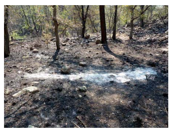
Once lizard habitat – now just a scar of ash

The first few days after we arrived to the station, we were restricted to station grounds. My field site, just a mile down the road near the John Hands Campground, was inaccessible to us for another few days. Once