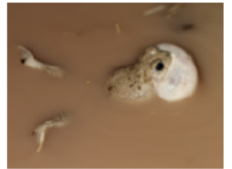
Calling male spadefoot toads. Left: A Mexican spadefoot (Spea multiplicata); Right: A Plains spadefoot (Spea bombifrons). The black shapes visible on the feet of the Mexican spadefoot are the spades that give the toads their name. The spade is used to dig themselves underground to escape the heat and drying of the desert.

behavior of desert toads since 1995. The goal of this research has been to uncover how and why females choose the mates that they do. The work is focused on spadefoot toads. These toads breed on a single night following a rainstorm, so females must choose their mate