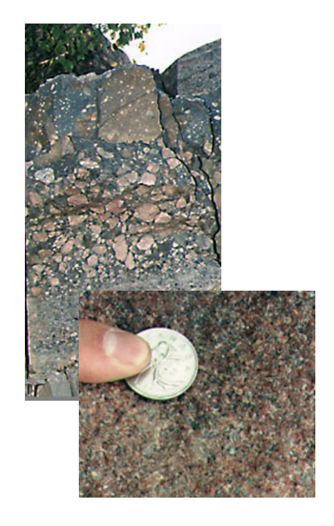
Gowganda Glacial Conglomerate

This rock is very even and consists mostly of the minerals quartz and feldspar. The fact that it's red tells us that it's been rusted. This rock is more than 2 billion years old.