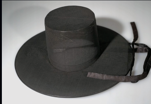
Catalog No: 70 / 42740

ENTER TO WIN A FREE ADMISSION PASS TO THE MUSEUM! Visit www.facebook.com/naturalhistory for more information.