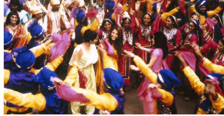
Bride & Prejudice , © Miramax Pictures

The Silk Road Project residency is generously supported by Rosalind P. Walter .