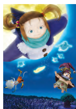
Yona Yona Penguin