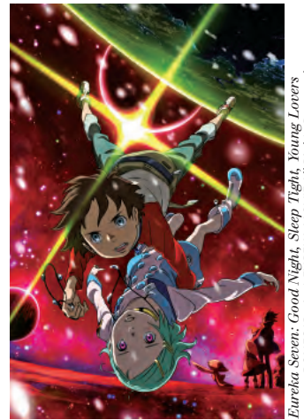
Eureka Seven: Good Night, Sleep Tight, Young Lovers