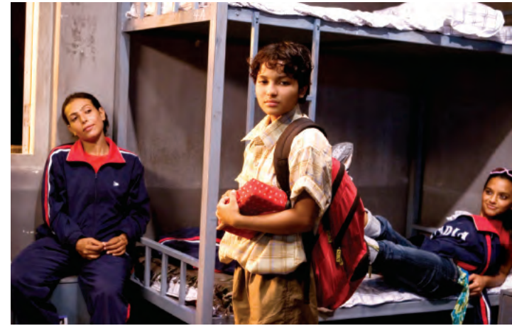
ChakDe! India, © Yash Raj Films

The U.S. premiere of a fantasy adventure directed by internationally renowned auteur Rintaro features Coco, an adventurous little girl who is obsessed with penguins. One night, Coco receives an invitation, and what awaits her is an encounter with a world she has never seen before. The film was featured at the 66th Venice International Film Festival.