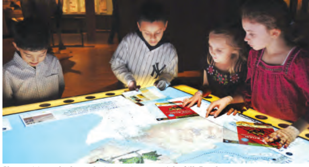
Young visitors check out the interactive map of the Silk Road

Traveling the Silk Road: Ancient Pathway to the Modern World Through August 15