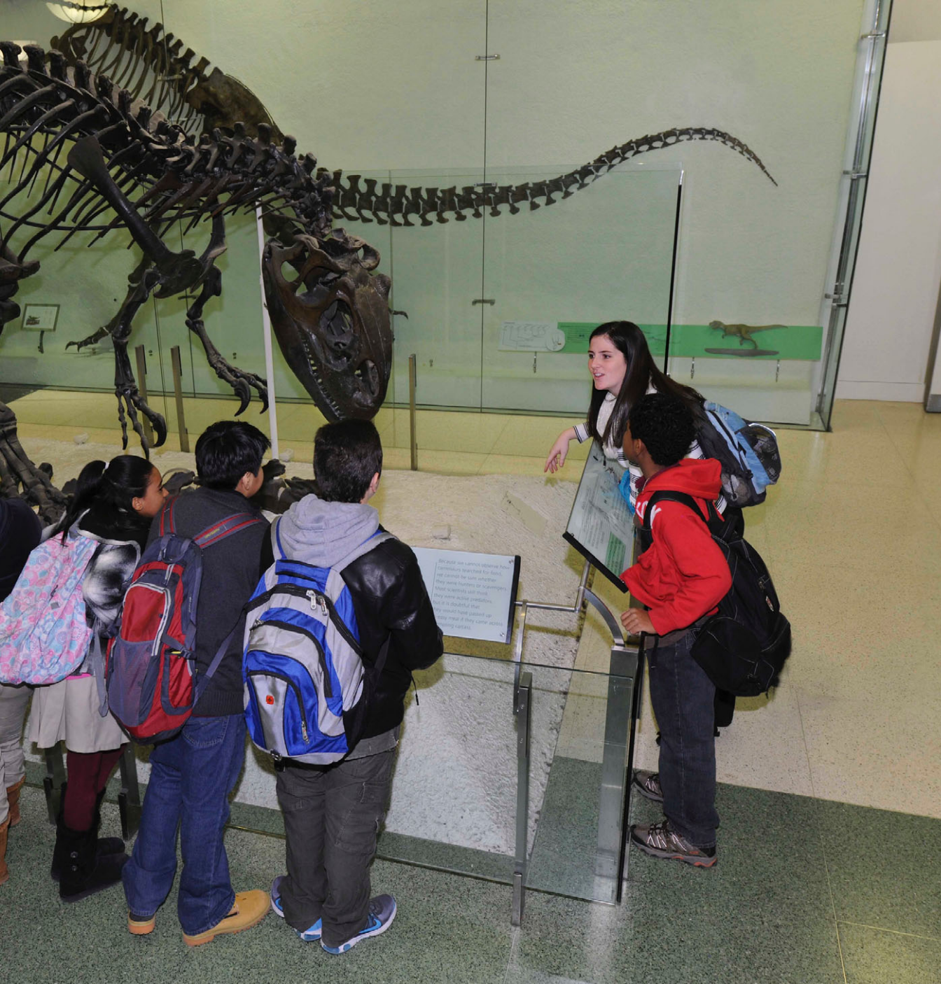
Figure 4. An MAT resident teaching in the museum. [Color figure can be viewed at wileyonlinelibrary.com ]

experiences we provide for these mentors, and working on aligning assignments we give our pre-service teachers with these specific teaching practices.