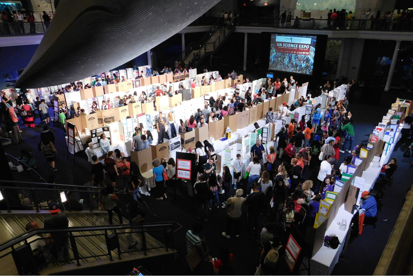
Figure 2. Urban advantage annual science expo. Students presenting their investigations. [Color figure can be viewed at wileyonlinelibrary.com ]

schools participate—nearly half, roughly 45%, of New York City middle schools.