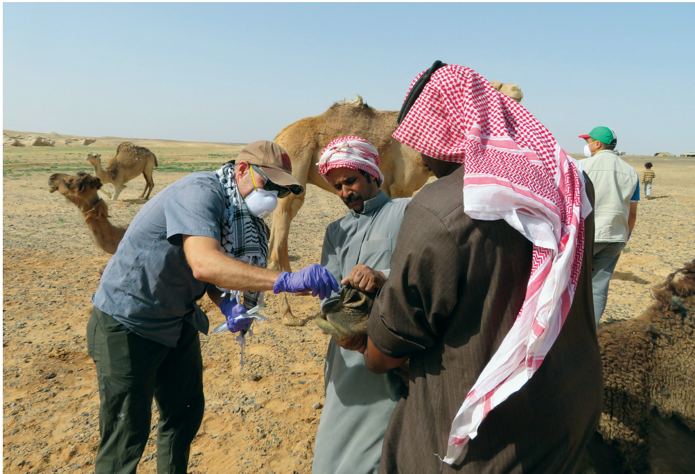
Figure 3. Testing for MERS

A scientist swabs the nose of a dromedary camel to test the sample for MERS coronavirus.