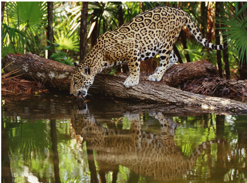
Figure 1. Jaguars ( Panthera onca ) are the largest cat species in the Americas, and they are categorized as Near Threatened by the International Union for the Conservation of Nature (IUCN Red List 2017; https://dx.doi.org/10.2305/IUCN.UK.2017-3.RLTS.T15953A50658693.en )

It has been a stress-filled time in Lion's Gate, a town in the northernmost section of Belize (Figure 2). Everyone is still working on repairs after a Category 1 Hurricane hit the region the month before. People have also been talking about the recent name-change of the town. For as long as everyone knew, the name of the town (and entire area) was Corozal, a name of Spanish colonial origin; but recently the town name was changed to "Lion's Gate." This was spurred by the release of a new blockbuster feature film about a pet mountain lion iii that rescues tourists in an area that the film calls Lion's Gate. The aim in changing the name was to capitalize on the area's new tourism potential. Soon, the newly refurbished entrance to the town's local zoo and animal rescue center would be unveiled in a grand re-opening ceremony. The new entrance features a visitor's center, a mural (depicting scenes from the feature film), and a pillared gateway crowned by cat faces carved out of stones. Additionally, Lion's Gate is home to a growing community of North American and western European retirees. This morning, the town's local newspaper ran a story based on a press release from the New York Post titled "Jaguar Kills Yank" (see the press release re-printed below).