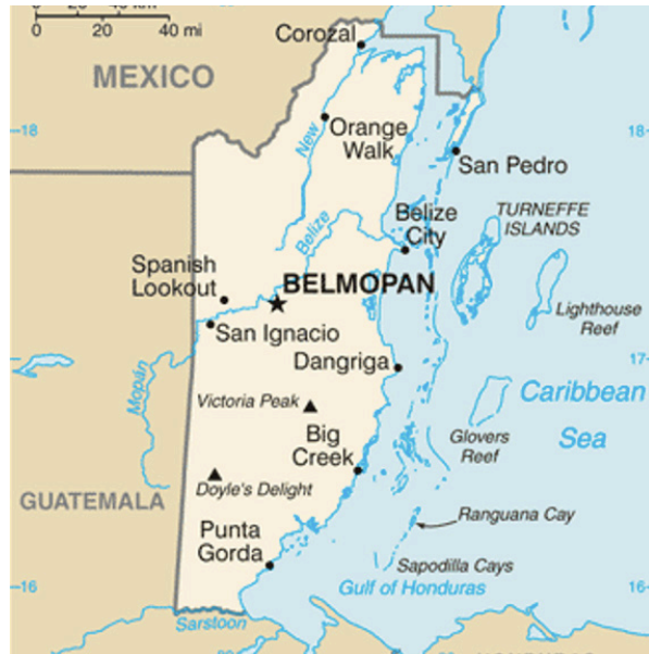
Figure 2. A map of Belize. Belize is an English-speaking country that borders Guatemala and Mexico. The town of Corozal is located in the north, close to the Mexican border.