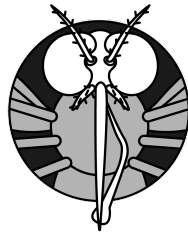
piercing and sucking