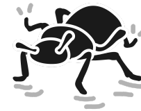
walking or running