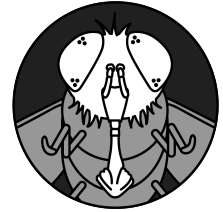
licking and sponging

||||| Make tally marks for the different mouthparts you discover.