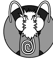
sipping through straws