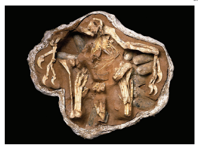
This is one of the Citipati fossils. The feathered wings are spread over the nest to protect the eggs, the same way birds do today.

Think Aloud: Wow! We just learned of an important discovery of dinosaur fossils in 1993. Think-Pair-Share: Describe the discovery that Museum scientists made in the Gobi desert in 1993. Explain how the fossils they found led them to a very different conclusion than the team of scientists that had gone to the same place seventy years earlier. If students are struggling readers, you may want to pause after each paragraph in this section to summarize the information before reading on, rather than merely giving these instructions at the end of the section.