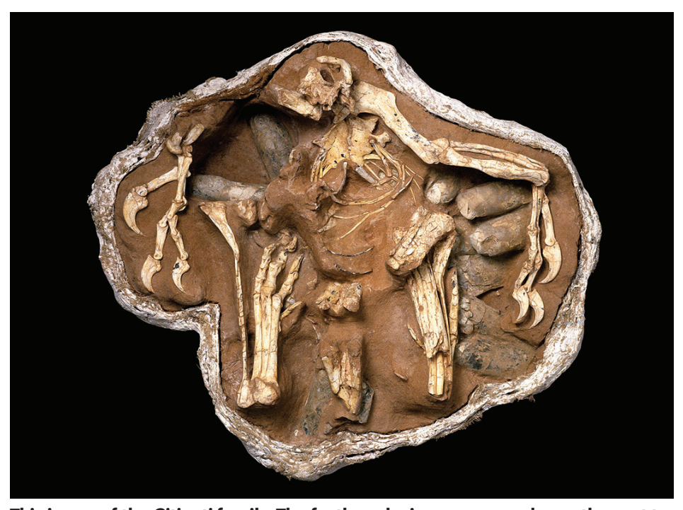
This is one of the Citipati fossils. The feathered wings are spread over the nest to protect the eggs, the same way birds do today.

Seventy years later, in 1993, another team from the Museum found very similar fossil eggs in the same desert. One of the eggs held a fossil embryo, or developing baby dinosaur. It turned out to be a baby Citipati (sit-uh-PAH-tee), a kind of dinosaur very similar to Oviraptor . Later, the team discovered a fossil of an adult Citipati over a nest. It was brooding, or sitting on the nest, the same way birds do: with its arms spread to protect the eggs. And if its arms were covered with feathers, as scientists suspected, these wings would have shielded the eggs from heat and cold. Paleontologists realized that these dinosaurs nested like birds living today.