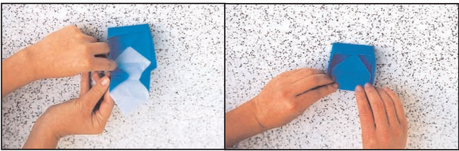
8. For the fourth and last side of your box, raise the remaining end and fold this flap into the center. You may need to sharpen your creases to finish off the box.