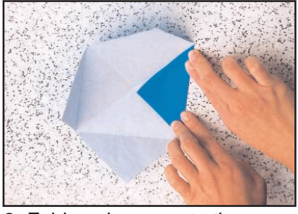
2. Fold each corner to the center.