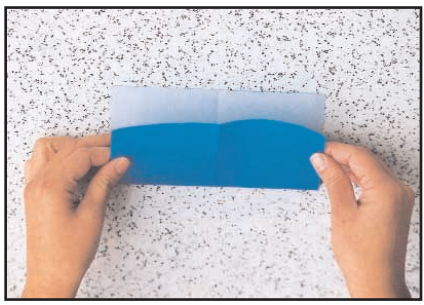
1. Fold the square in half both vertically and horizontally.