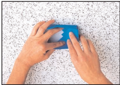
7. Fold the flap at the raised end in to the center. You should have three of the four walls of your box.