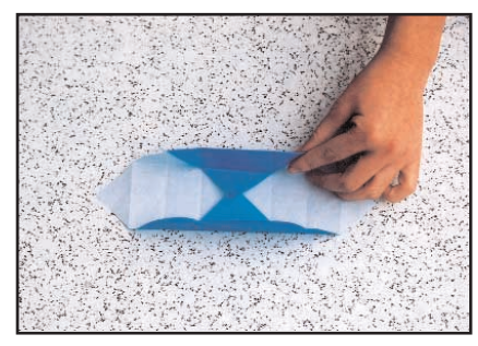
5. Lift the sides so they are vertical.