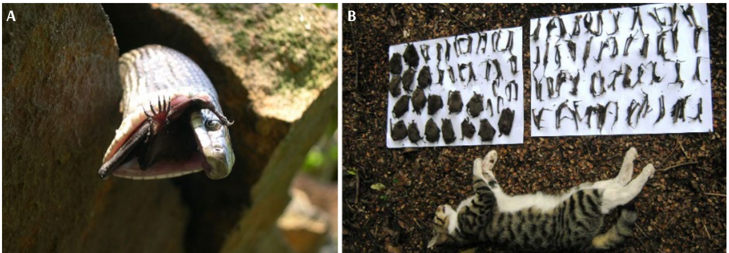
Figure 6. (A) A black rat snake eating a brown bat. (B) A feral cat in New Zealand and some of the remains of 107 dead short-tailed bats.

bats and wood mice in the Netherlands have been observed cracking open the skulls of hibernating bats, like nut shells, and eating their brains (Moseley et al. 2013; Haarsma and Kaal 2016)! The bats—in a basically non-animated state of hibernation—are unable to fly away, defend themselves, or warn others of the threats.