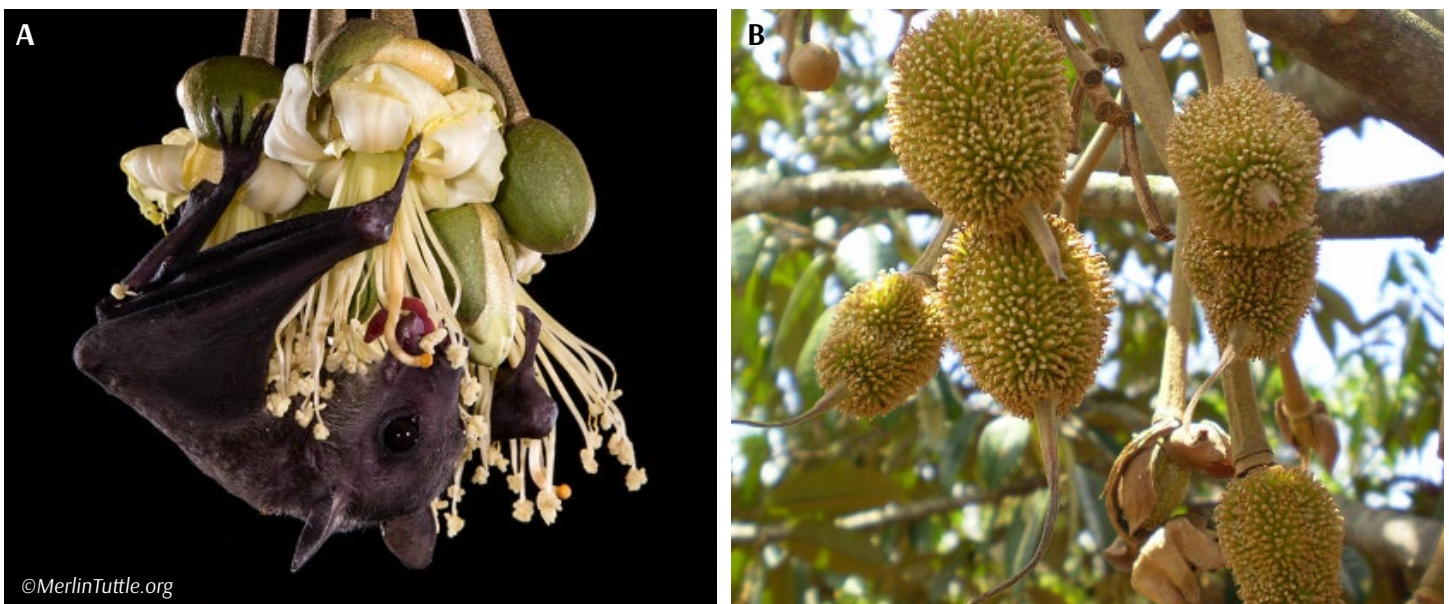
Figure 5. The Dawn Bat ( Eonycteris spelaea ) is the only effective pollinator of the flowers of the durian tree (A) and the pollination of the tree leads to the durian fruit (B)—often considered one of the smelliest fruits in the world. Although not a particularly popular fruit in the US, the sweet tasting fruit is very popular in Asia; Thailand alone produces almost 600 million US dollars worth of durian each year (Bumrungsri et al. 2009; Ghanem and Voigt 2012).

Note that not all humans are benefited by frugivore bats living nearby. Fruit farmers, for instance, may consider bats a pest species because they eat their crops. We’d call this an ecosystem disservice. Unfortunately, the loss of bats’ natural habitats and food sources (through events such as forest clearing or droughts) intensifies damage to crops by fruit-eating bats. There are strategies to help prevent, reduce, or mitigate crop loss due to bats, including restricting the clearing of existing habitat for new agriculture and trying to prevent access to existing fruit crops, through covering fruits with netted bags, covering trees with netted tents, or covering entire orchards with nets supported by frames. These solutions require cooperation at many levels, including farmers, communities, governments, and corporations tackling large systemic issues such as climate change and deforestation.