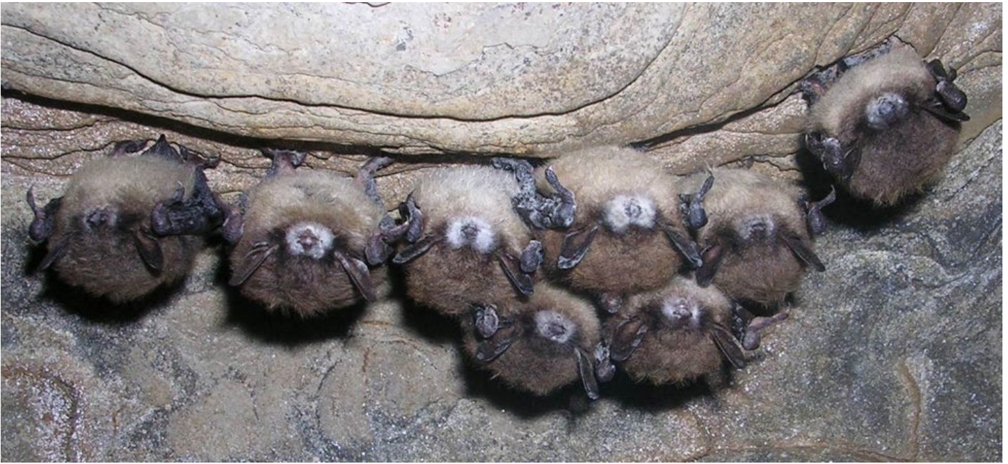
Figure 7. Bats infected with WNS.

of these viruses is still poorly understood, but there is evidence that diseases can be transmitted to humans through interaction with the body fluids of bats (blood, feces, and saliva) (Schneeberger and Voigt 2016). Rabies is another example and the only example of a viral disease associated with bats in North America and Europe (Schneeberger and Voigt 2016). Like other mammals, bats can contract rabies but it isn't considered a significant source of mortality, and it is rarely transmitted to humans (Taylor and Tuttle 2019). Even if a human is exposed to rabies, the probability of getting infected with rabies is virtually to zero if people are treated appropriately with a post-exposure vaccine after a bat scratch or bite (Schneeberger and Voigt 2016).