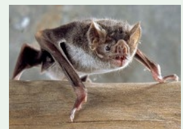
E. Common Vampire Bat