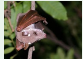
C. Wahlberg's Epauletted Fruit Bat