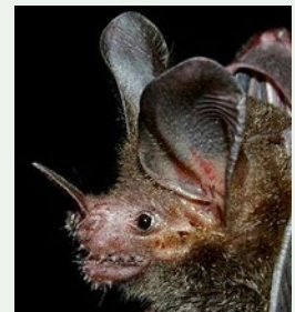
D. Fringe-lipped Bat