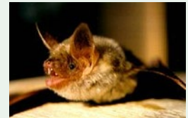
B. Greater Mouse-eared Bat