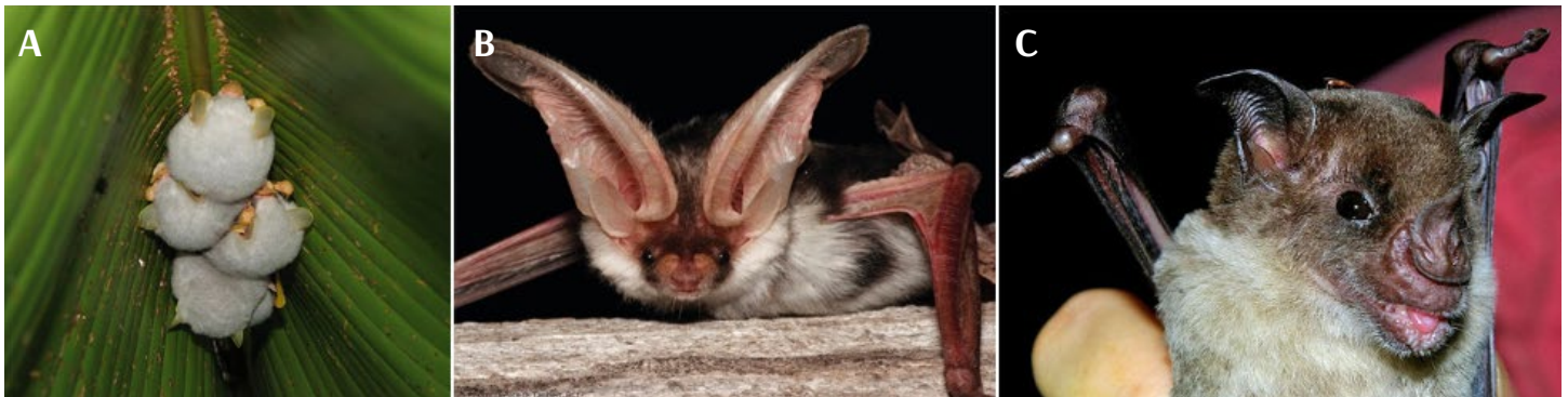
Figure 3. Bats don't all look or act the same. (A) Honduran White Bats ( Ectophylla alba ) are all white with yellow snouts and ears and they roost in "tents" they make from large leaves. (B) Spotted Bats ( Euderma maculatum ) have pink wings, ears nearly as long as their bodies, and are known to roost on cliffs along the Grand Canyon among other places. (C) Pale Spear-nosed Bats ( Phyllostomus discolor ) have a fleshy appendage on their noses called a "nose-leaf" which may help with echolocation and they roost in hollow trees or in caves.

(like the Large Flying Fox). The microbats are smaller (hence "micro"), are often predators that hunt mainly insects (but can also hunt other prey such as rats, birds, frogs, other bats, or might also be omnivorous or herbivorous), have smaller eyes with short snouts, and sometimes have large ears and fleshy appendages on their noses to help with echolocation. The megabats are bigger ("mega"), more likely to feed on fruit or nectar, and have larger eyes and elongated snouts. Megabats normally have better eyesight and sense of smell than microbats, to help them locate their fruit or nectar food source, and are less reliant on echolocation. Instead of making echolocation noises with their larynx as most microbats do, most megabats don't echolocate at all, or they use tongue-clicking or even click their wings to help with navigation (Taylor and Tuttle 2019).