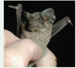
A. Brazilian Free-tailed Bat