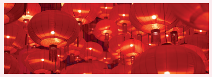
Across Asia, red is considered auspicious and plays a role in many celebrations.

Colors can evoke emotional reactions. Some depend on the individual. But many responses are cultural, and different cultures can interpret the same color differently. For example, in the United States many brides wear white, but in much of Asia the color for weddings is red. Pharmaceutical companies make few black pills for the American market because of the color's associations with depression and death, but in India black pills can inspire confidence, helping the pills sell better. And colors can help strengthen group bonds: Think of team colors, flags, and political maps. And colors' cultural meanings can change over time. In the United States today many people associate blue with boys and pink with girls, but that has not always been the case; in 1927 a survey found department stores evenly split about whether pink was for girls or for boys.