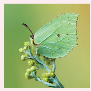
Can you find the organism that uses camouflage and mimicry?

Colors can help animals blend in with or stand out from their surroundings, both of which can help them survive and reproduce. Camouflage , or blending in with the background, can help organisms hide from predators. Likewise, mimicry , or looking like another object or organism, allows some animals, like the leaf-mimic katydid, to hide in plain sight. Predators can benefit from mimicry too, disguising themselves as something harmless or even enticing. For example, the orchid mantis tricks its victims by resembling a flower and eating insects that approach it. But sometimes it's good to stand out, and color can help with that. For example, toxic animals can use bright colors to warn predators not to eat them; plants can use color to advertise ripeness so animals will eat their fruit and distribute the seeds in their droppings; flowers can use color to attract pollinators; and