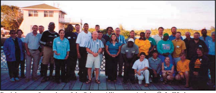
Partial group of attendees of the Science Alliance on Andros.

The 2005 Science Alliance Conference was held on February 4–5 at the "Love at First Sight" Resort on Andros Island, Bahamas. Over 150 scientists, officials, conservation practitioners, educators, students, and interested citizens attended to discuss and learn about scientific developments pertaining to Andros Island. The conference had many supporters including Forfar Field Station (International Field Studies, Nelsonville, Ohio), The Nature Conservancy, the Bahamas Sport-