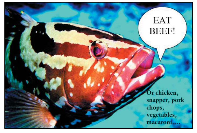
Grouper postcard mailed to consumers in The Bahamas and abroad.

This past winter saw the nationwide closure of the Nassau grouper season from December 16, 2004 through February 16, 2005. In addition, the spawning aggregation site off High Cay, Andros, was closed for the entire spawning season.