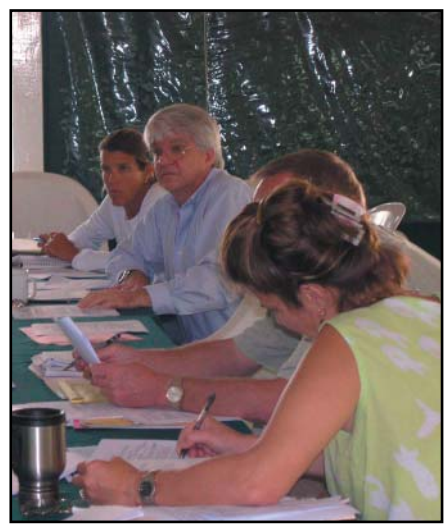
Partnership management planning team meeting at BNT.