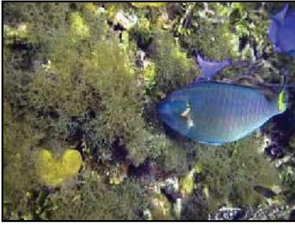
This parrotfish, of the species Sparisoma viride , is grazing in a large patch of macroalgae.