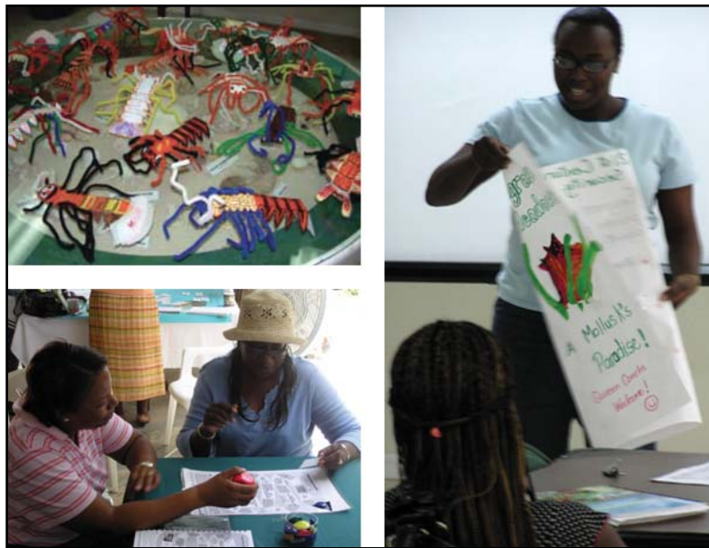
Teachers tested "Crawfish Critters", "Grouper Race for Survival", and "Real Estate for Royalty", a few of Treasures in the Sea's hands-on activities that explore the form and function, life cycles, and habitat requirements of marine species. Top left, L. Gape © BNT and bottom left and right, M. Domroese © AMNH-CBC

To provide additional information and distribute Treasures in the Sea broadly, a website was launched in November. Visit the site to download the book or sections of the book, link to resources related to the activities, find out about training workshops in The Bahamas, and share teaching ideas and experiences in marine conservation education: http://treasures.amnh.org?mid=37