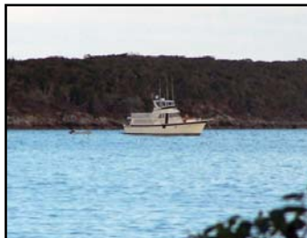
The first boat to use one of the new moorings in the Exuma Cay Land & Sea Park.

Park staff and dedicated volunteers at the Exuma Cays Land & Sea Park have completed installation of almost 100 additional moorings throughout the park over the last year. In total, over 140 moorings are now in place in popular dive and snorkeling sites and anchorages.