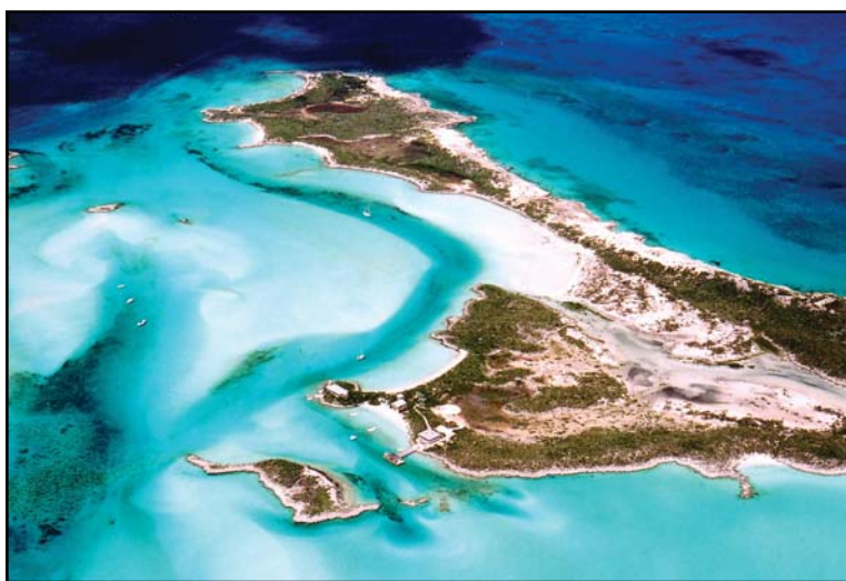
An aerial view of the original Warderick Wells Mooring Field. In the image, 5 of the original 22 moorings are occupied by boats.

The park, one of 25 national parks and protected areas managed by the Bahamas National Trust, encompasses 176 square miles of land and sea in the central Exuma island chain. Visiting boat traffic has been increasing steadily over the past ten years, raising concerns over the amount of damage caused to the seabed from repetitive anchoring in selected areas. Original moorings at the Warderick Wells location and dive sites were established 15 years ago through a cooperative effort with dive boat operators. These original moorings have proven very successful at allowing the seabed to recover from past damage and preventing additional damage, and have also improved the visitor experience in the park. With funding from the U.S. National Fish & Wildlife Foundation, Mr. & Mrs. Jim & Barrie Loeks, the Lyford Cay Foundation, the Moore Foundation, and a variety of other private donors, the park expanded the program to make moorings available to visiting boats in all areas of the park.