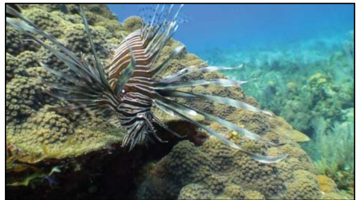
Indo-Pacific red lionfish have invaded Bahamian waters.

While we were pleased to see such rich reef systems, other observations are cause for concern. At sites around both the Exuma Cays and Conception Island the team spotted numerous Indo-Pacific red lionfish ( Pterois volitans ). This species is alien to the Caribbean but has been spotted in many parts of The Bahamas (including Abacos, Andros, Eleuthera, Cat Island, San Salvador, and New Providence). The population probably started when fish were released from aquaria. They now appear to be breeding and pose a threat to other native fish species as they are voracious predators. Divers from dive boats often spear any lionfish they see but the population seems to be too large for this to be an effective way to eradicate the species from The Bahamas. In one week, the dive operators we were using during our research speared 53 lionfish!