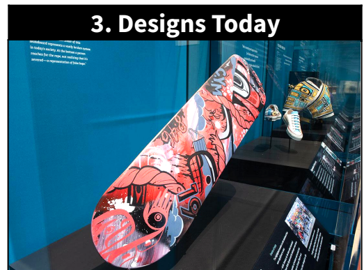
3. Designs Today