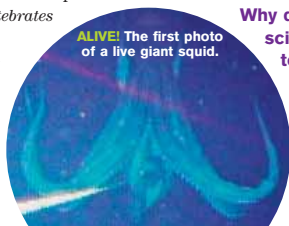
ALIVE! The first photo of a live giant squid.

That's one of the many questions we don't know the answer to. The giant squid that the Japanese scientists photographed was hunting prey in very deep waters—roughly 900 meters (2,950 feet). There isn't any light there. So why would the squid need such big eyes? There are some theories: For instance, although the giant squid is believed to live well below the area of the ocean where light penetrates, they may use their large eyes to spot animals that phosphoresce , or chemically produce their own light.