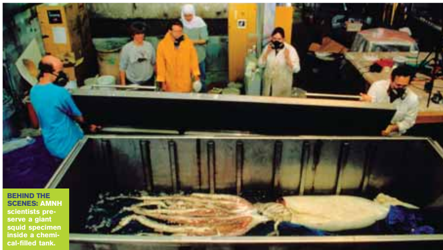
BEHIND THE SCENES: AMNH scientists preserve a giant squid specimen inside a chemical-filled tank.

That's because older life forms are also a part of the diversity of life on Earth. There is no real dividing line between living and extinct organisms.