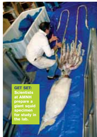
GET SET: Scientists at AMNH prepare a giant squid specimen for study in the lab.