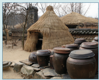
Before refrigeration, access to vegetables during winter was difficult. Koreans often made huge batches of kimchi, salted and fermented vegetables preserved in pots and sometimes protected from early spring sunshine by small grass huts.

economics, trade, and individual creativity. Recipes, both oral and written, gave food its own language. We know from an ancient cookbook that ingredients from Persia, Central Asia, and China blended into inventive feasts in the court of Mongolian ruler Kublai Khan. Modern examples of fusion cuisine include pineapples on pizza and sweet plantain in sushi.