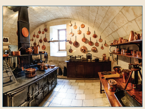
French chefs are famous for using copper pots, like those in this kitchen. Copper, an excellent conductor of heat, has been used in cooking for thousands of years in many parts of the world.

People in almost every culture around the world cook. Have students explore similarities and differences in the ways cultures around the world preserve and prepare food. (e.g. high-heat cooking in China, grinding corn in Mesoamerica,