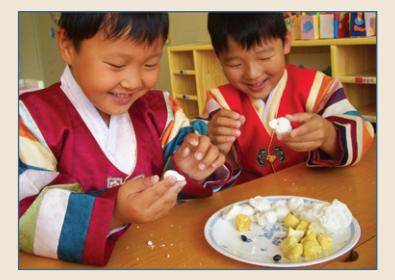
For their harvest festival, Korean families make songpyeon: steamed rice dumplings filled with sweet sesame, bean, or chestnut paste.

• "Celebrations" theater and objects: Invite students to watch the video and examine objects to explore how food is part of celebrations and rituals around the world, such as China's Autumn Moon Festival and the Day of the Dead in Mexico.