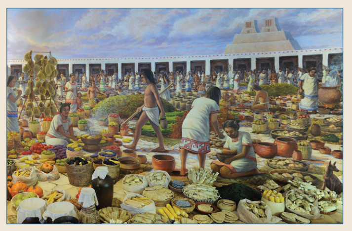
Vast and well organized, the market of Tlatelolco served up to 60,000 people a day. Beyond its walls loomed the Aztec city's great pyramid.

• Aztec marketplace diorama: Walk through the giant marketplace near Tenochtitlán in 1519 with your students. Food and other items were carried to this capital city from all over the thriving Aztec Empire (now Mexico). Invite students to examine what's for sale and to identify foods that look familiar. (e.g. peppers, tomatoes, corn) What common foods are missing? (e.g. bread, cheese, chicken) Have them find chocolate in different forms and explore how the Aztecs used it. (e.g. beverage, currency, tribute to conquerors, offerings to gods)