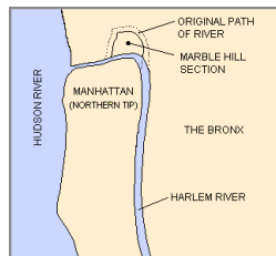
Map of Manhattan