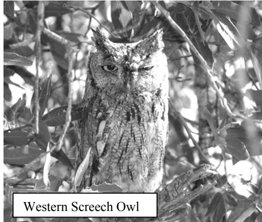
Western Screech Owl

Spring White butterflies were spotted at the research station on March 5, with Mylitta Crescents and Sleepy Duskywings appearing on the 16 th and 19 th . By the 21 st , Zone-tailed Hawk, Magnificent Humming-birds and Blue-throated Hummingbirds were all being recorded at the research station. Mountain Bluebirds were present in the desert flats below Portal on March 8. A very early Buff-breasted Flycatcher appeared at the research station on the 24 th , and spent the next 2 weeks near the swimming pool. By the end of the month, Ash-throated Flycatchers and Lucy's Warblers were being seen in the desert flats.