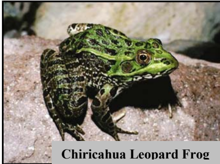
Chiricahua Leopard Frog

Next summer the Southwestern Research Station will be working with the Arizona Game and Fish Dept. (AGFD) and the U.S. Fish and Wildlife Service (USFWS) to reestablish Chiricahua Leopard frogs ( Lithobates chiricahuensis ) back into the eastern half