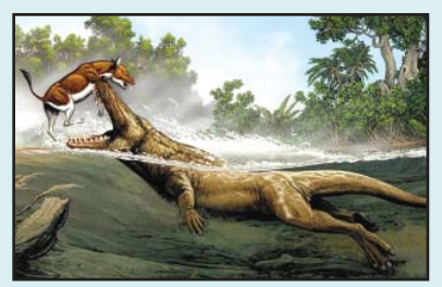
Ambulocetus , an amphibious early whale with legs, probably hunted small mammals much as today's crocodiles do.

• Walking whale model: Explain that like most other mammals, all whales are descended from an ancestor with four limbs and feet. Ask students whether Ambulocetus lived in water or on land, and to support their answers.