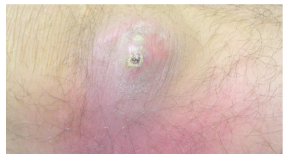
A staph infection can occur when the bacteria gets under human skin.

Staphylococcus gets its name from its round shape. Coccus means “little ball” and staphylo means “bunch of grapes” (shown here in yellow). That’s what staph bacteria look like under the microscope – a bunch of grapes. The word aureus refers to its golden pigment.