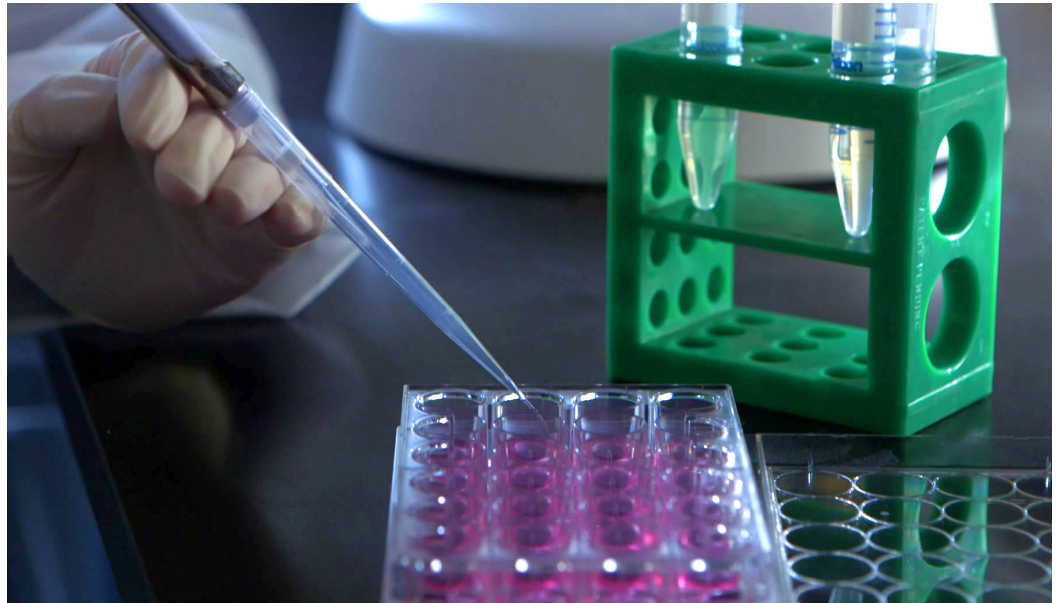
At the start of their experiment, scientists pipette knock-out samples of the speG gene onto live human skin cells growing in vials at Columbia University Medical Center in New York City.

First they had to prepare the knockout USA300. How could they get the bacteria to take in the foreign DNA with the modified gene? Well, as the scientists know, bacteria are very good at adopting foreign DNA into their genome. They do it all the time. They researchers decided to use the bacteria's own process of transformation. They placed USA300 bacteria in a medium that contained the mutant speG gene. Then they used small electric shocks to stimulate the USA300 bacteria to open pores in their outside cell membranes and take in the foreign DNA. This way, they successfully got some of the bacteria to replace their original speG gene with a non-functioning version.