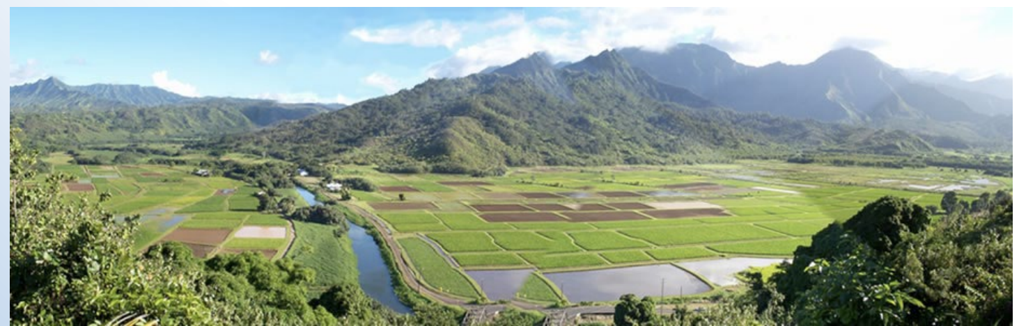
<sup>1</sup> Marine Resource Specialist, Division of Aquatic Resources, Hawai'i Department of Land & Natural Resources <sup>2</sup> Hanalei Watershed Hui

(Achatinellidae family). Five ahupua'a, the traditional Hawaiian land division, drain into Hanalei Bay. There are also three culturally important fish ponds, a traditional Hawaiian aquaculture technique that encloses or diverts stream waters into an enclosed near shore area for purposes of rearing fish for local consumption. The Hanalei River is one of fourteen American heritage Rivers in the United States.