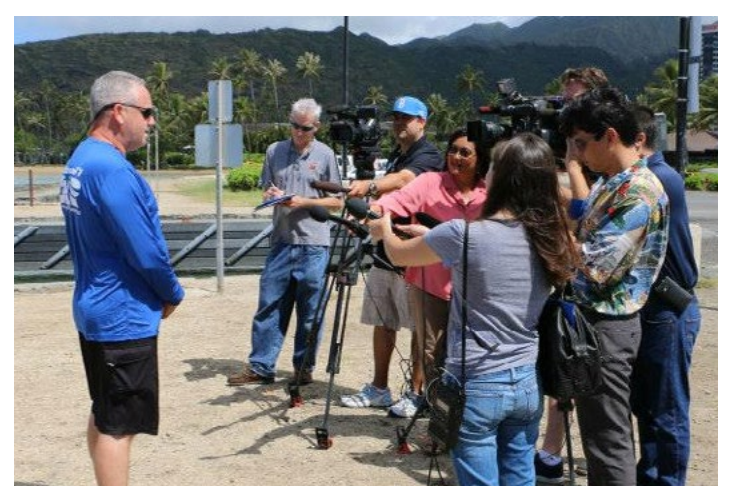
Answering media questions about the coral disease response

In 2004, scientists studying the reefs on the North Shore of Kaua'i first observed a black band coral disease at low levels. Then, in 2012, outbreak levels of the disease were reported to the volunteer reporting network, Eyes of the Reef (EOR). Scientists with the United States Geological Survey (USGS), Hawai'i Institute of Marine Biology (HIMB), and the National Ocean and Atmospheric Administration (NOAA) have now confirmed that the disease affects three species of rice corals ( Montipora capitata , M. patula , and M. flabellata ), and, with some variation across sites, approximately 1-8% of colonies of these species. While these percentages