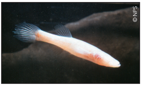
Blind cave fish, Mammoth Cave National Park, Kentucky

How does this happen? Do cave fishes go blind because they don't use their eyes? Though at first this idea might seem to make sense, it actually has no basis in science. It is your genes that determine which <u>traits</u> you inherit. For example, you have five fingers on each hand because of the <u>genes</u> you got from your parents. However, if you have an accident and lose a finger, your