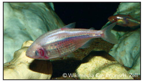
Mexican tetra (Astyanax mexicanus).

Scientists have studied one species of blind cave fish, the blind Mexican tetra ( Astyanax mexicanus ). They have come up with competing explanations for blindness in that fish, which likely will help them to understand other cave fishes as well.