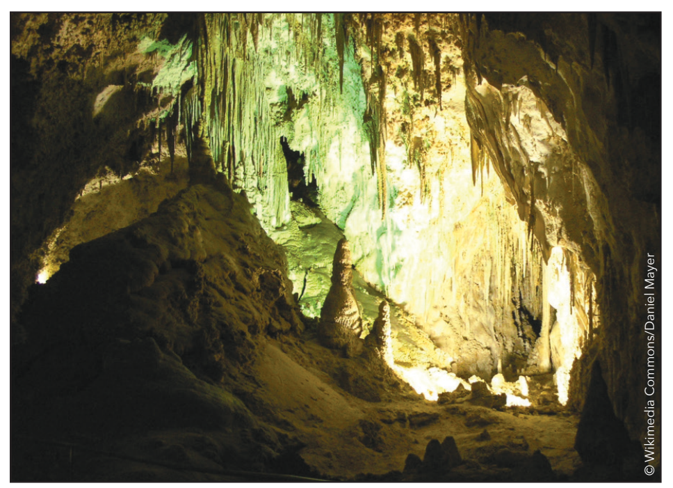
Carlsbad Caverns National Park

Deep underground there are caves where the sun never shines. If you found yourself in one of these caverns without a flashlight, you would see nothing at all; just total blackness.