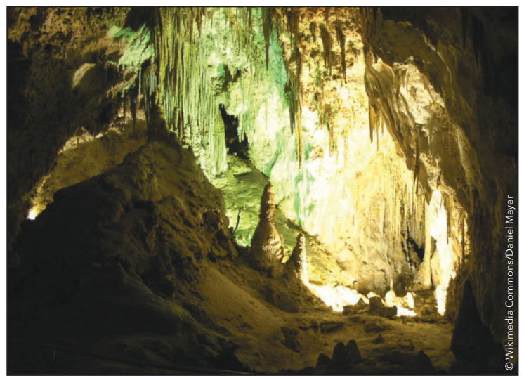
Carlsbad Caverns National Park

Deep underground there are caves where the sun never shines. If you found yourself in one of these caverns without a flashlight, you would see nothing at all; just total blackness.